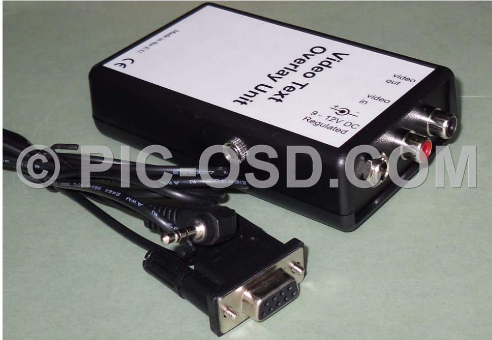
Serial Video Overlay Unit

The serial video overlay unit is housed in a smart plastic enclosure with phono connectors for video in / out and a 2.1mm DC power socket. It is designed to be powered from the same 9 - 12V DC regulated power supply as the camera and so the unit does not have a power switch. A 1.2m serial cable with a female DB9 connector is supplied for connecting the 3.5mm socket on the left of the unit to a PC serial port. Do not remove or replace the 3.5mm serial connector while the unit is powered. Connect the serial line, video in and video out before powering the system up. The program should run immediately that power is applied to the board and the text display will appear after approximately 1 second. See overleaf for serial program operation.